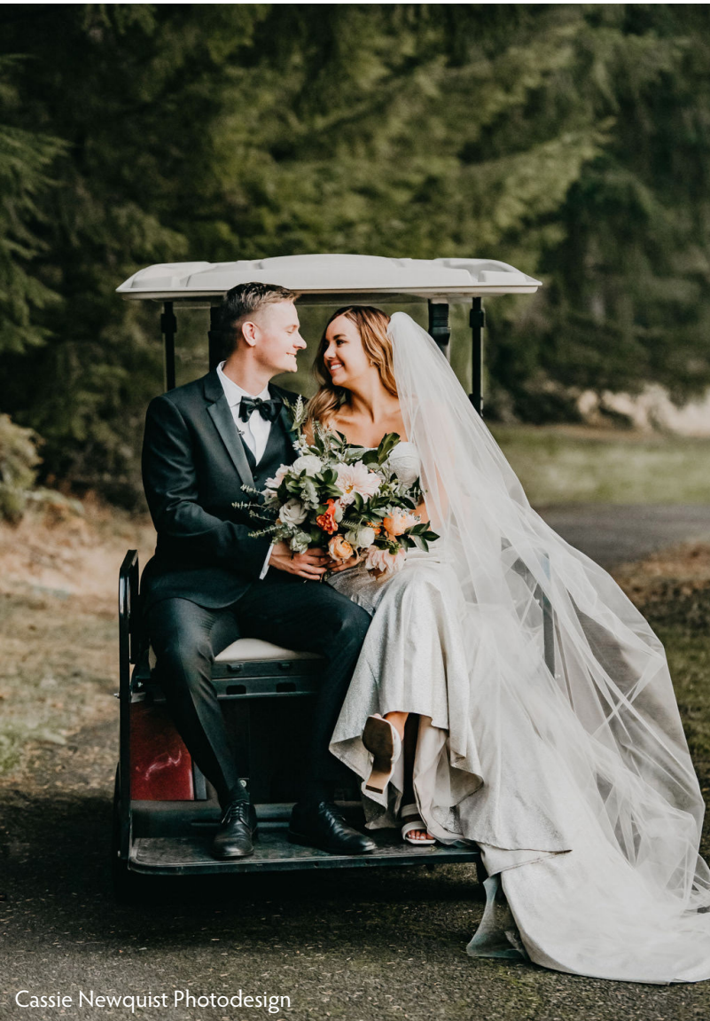
Cassie Newquist Photodesign