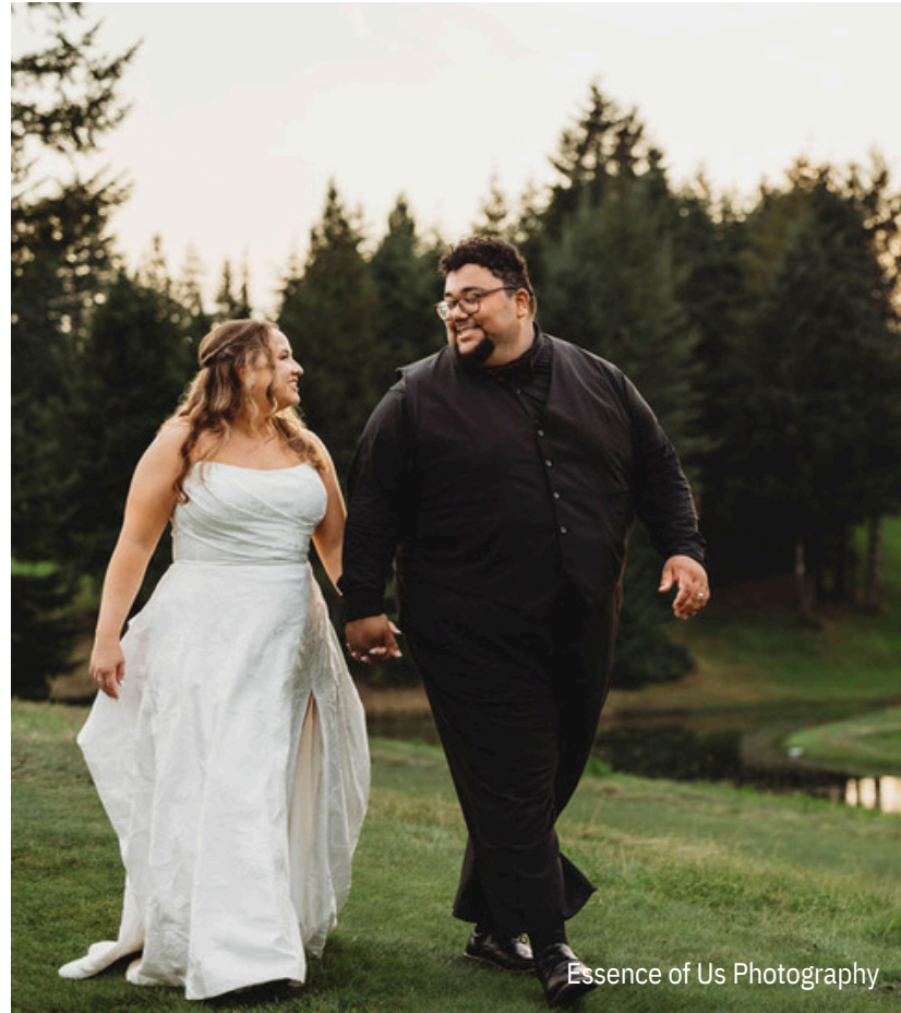
Essence of Us Photography

Rehearsal Dinner Packages Golf Outings and Discounts