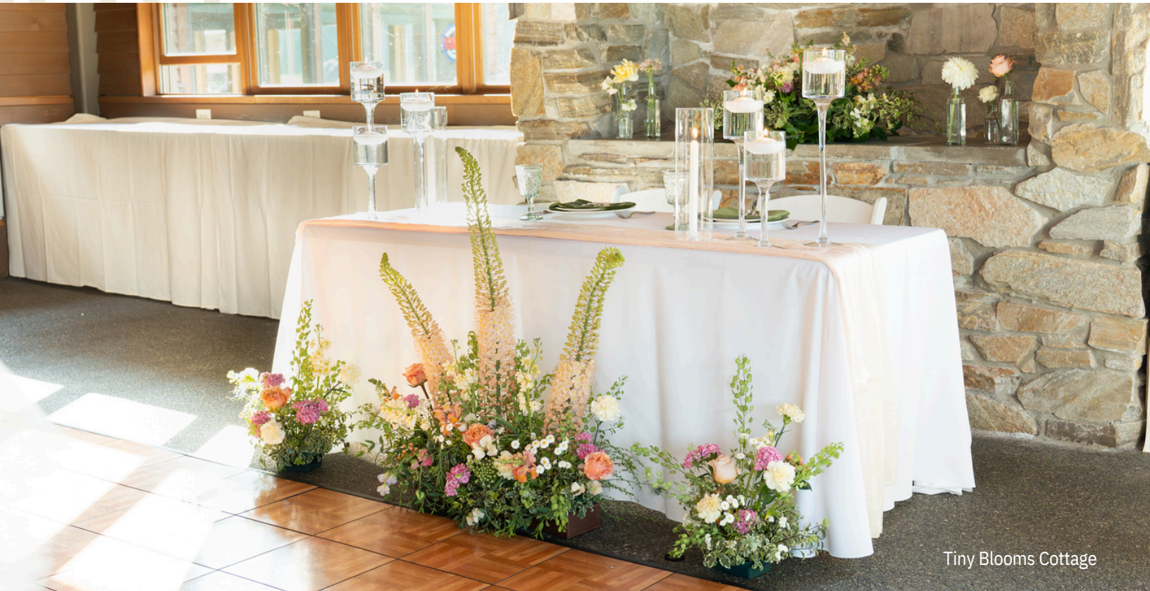
Tiny Blooms Cottage